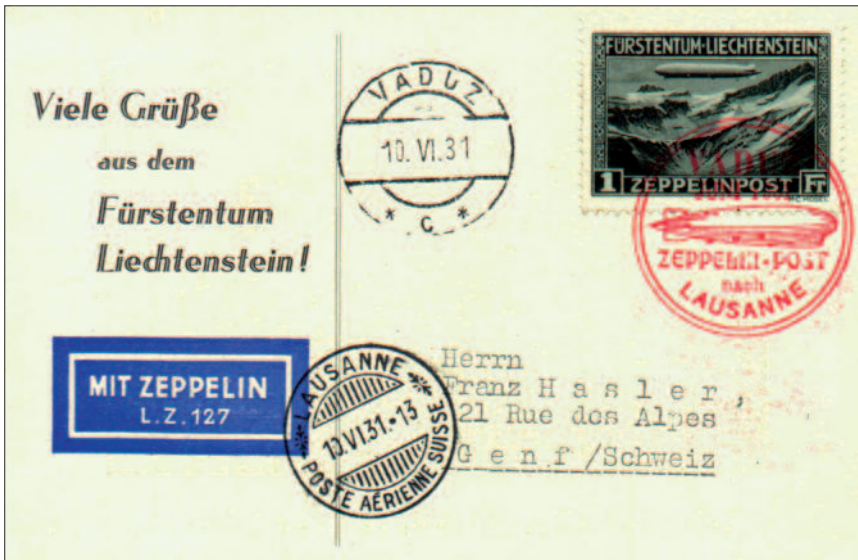
Liechtenstein Postcard franked with the 1 Franc Liechtenstein zeppelin stamp.

This zeppelin flight was not a normal round trip. In fact, the zeppelin was chartered by the Rotary Club from Solothurn, Switzerland. While the zeppelin mail from Liechtenstein was loaded at Vaduz and later dropped at Lausanne, the Rotary Club from Solothurn had a great time on board this Vaduz-Lausanne flight.