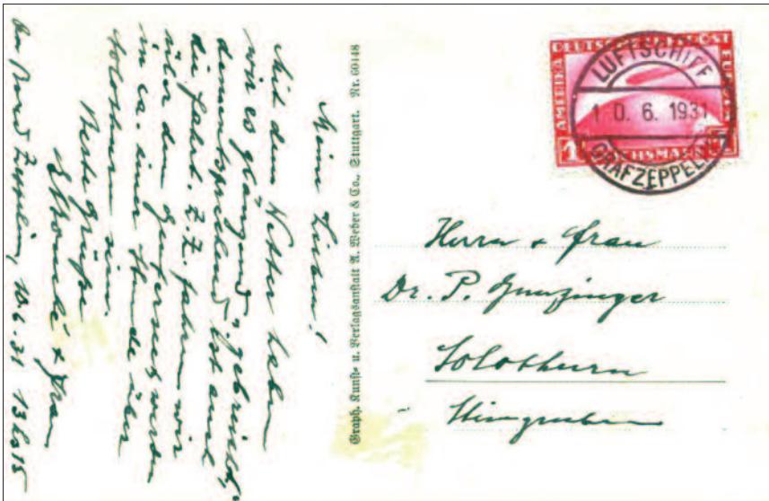
Solothurn Postcard written by a passenger on board over Lake Geneva. The card is addressed to Solothurn «...which we will reach in one hour».

But what is this, the engines are slowing down, the speed is reduced, oh well, we have duties to accomplish, duties of the postillion, because directly below are lots of people gathered, military, kids are moving around and even with the naked eye the postal officials can be recognized, we are only hovering, we are located over the Blécherette, the Lausanne airfield where our mail bags have to be delivered back to the ground. At one time, three yellow parachutes, each ballasted with a mail bag, leave the airship and float gently towards mother earth where they are received by deftly hands for transportation by mundane means, mostly by rail, to deliver the mail to the lucky addressees.